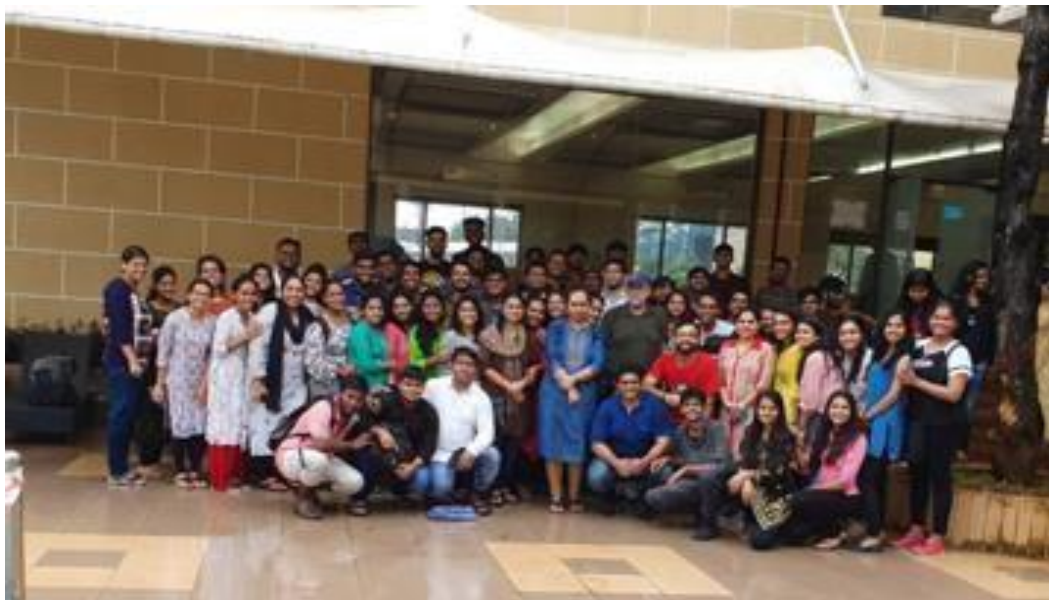
Students having Lunch post survey work